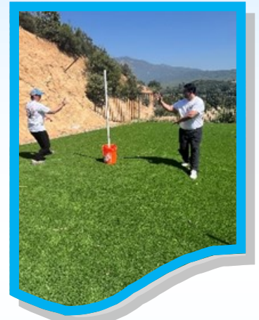
Practicing Ba Kua forms

I am always delighted to hear from all of you. Your dedication to Kung Fu and your respect for me and your grand teachers inspire me daily. Thank you for being part of this incredible journey.