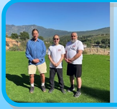
Students who have trained with me over 40 years