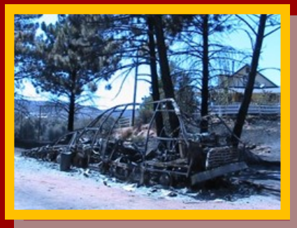
Old burned down

Little Nine Heaven Inc. 5268 Kalmia Street San Diego, CA 92105