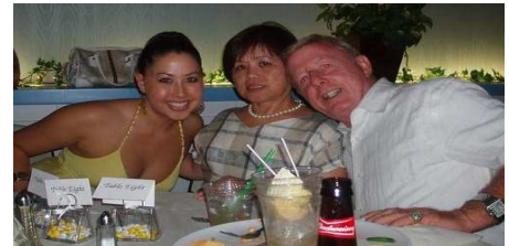
My parents and I in 2008

the cultures he or she comes from as my parents did for me. I thank my parents and my husband for helping me become the person I am today and instilling in me the important qualities of honesty, generosity, and most of all acceptance to all individuals.