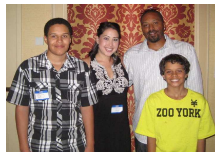
Family Reunion July 2011