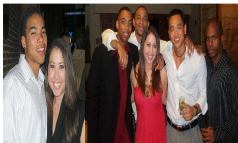
Some of my inspirations from college and now my best friends

Hearing the experiences of many of my friends who came from far less privileged environments than I did helped me realize my purpose in life...to bring hope into the lives of those less fortunate so they could make it like that my college friends had.