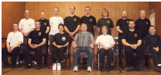
Chen-Tai Chi Group

I was in Manchester England doing a few seminars a group seminar in Taoist Lovemaking part one on energy and feeling, Hsing-I, Chen Tai-Chi and Splashing Hands. The seminars were a success.