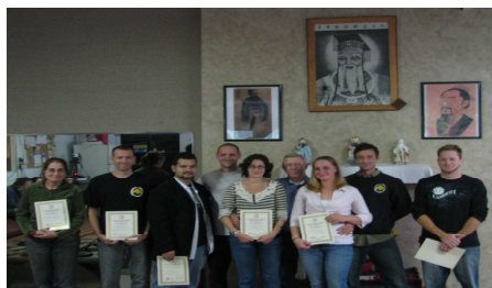
Giving of Certificate

It is always sad when a school has to close but I truly believe that the spirit of the St. Peters school will live on for many years, and the L9H family will stay together as a family. September 17 th was